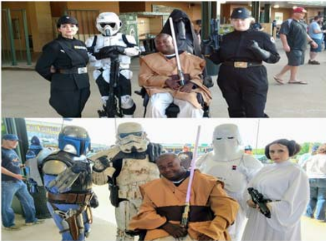
ABLE NRC Ambassador(s)